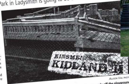
Kinsmen Kidland II is surrounded by orange fencing to keep people off the playground, which city staff say is unsafe and rotten.