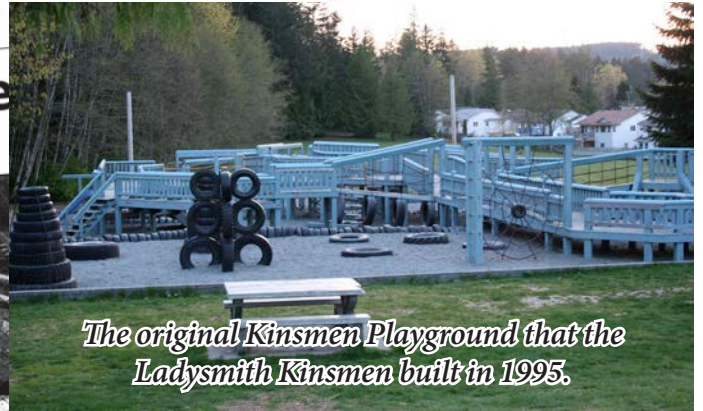
The original Kinsmen Playground that the Ladysmith Kinsmen built in 1995.