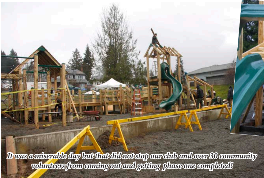
It was a miserable day but that did not stop our club and over 30 community volunteers from coming out and getting phase one completed!