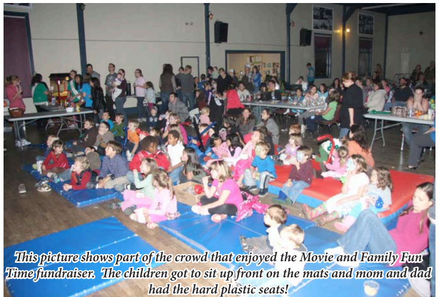
This picture shows part of the crowd that enjoyed the Movie and Family Fun Time fundraiser. The children got to sit up front on the mats and mom and dad had the hard plastic seats!