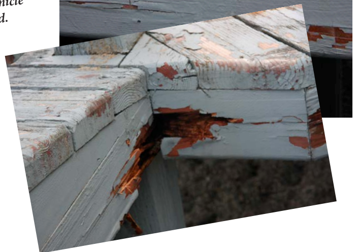
These pictures show some of the rot in the structural area in the original Kinsmen Playground at Kin Park.