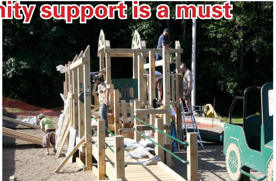
We were happy when we did phase two, the weather was so much better than a couple of months earlier when we started on phase one. In this picture a couple of the neighbours are helping to finish the "barn" in phase two.

The folks from the Oceanview Community Church once again approached us about doing some fundraising. The pastor dude from the church had an idea. Why not have a huge omelette cook-off on Father's Day ("Eggs Benefit"). They approached a local egg processing plant and they jumped at the idea. Island Gold Eggs was so excited, they said not only could we have all the eggs we wanted, they would supply staff to help put it together as well as work on the day.