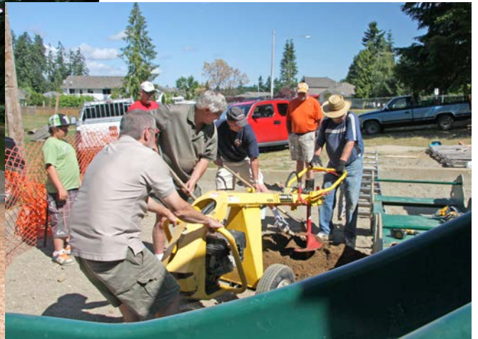
Some of the neighbours and Kin drilling the holes for the Jeep 4x4 in phase two.

Phase two was a bit of a breeze. The structure was smaller than the first but what really made it nice was the weather! Phase one we had typical “west coast torrential” rain the entire time, but for phase 2 it was beautiful.