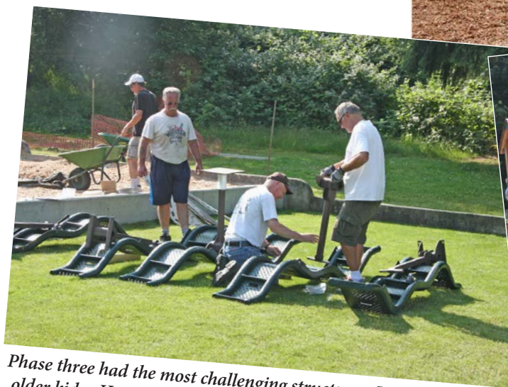
Phase three had the most challenging structures. It is meant for the older kids. Here Kinsmen and neighbours are trying to figure out how the Xccent X Waves go together!