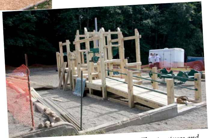
The Tot Structure, above, taking shape. The structures and equipment supplied by Henderson Playground Equipment was fairly easy to put together ... when following the instructions.

Phase two was a bit of a breeze. The structure was smaller than the first but what really made it nice was the weather! Phase one we had typical “west coast torrential” rain the entire time, but for phase 2 it was beautiful.