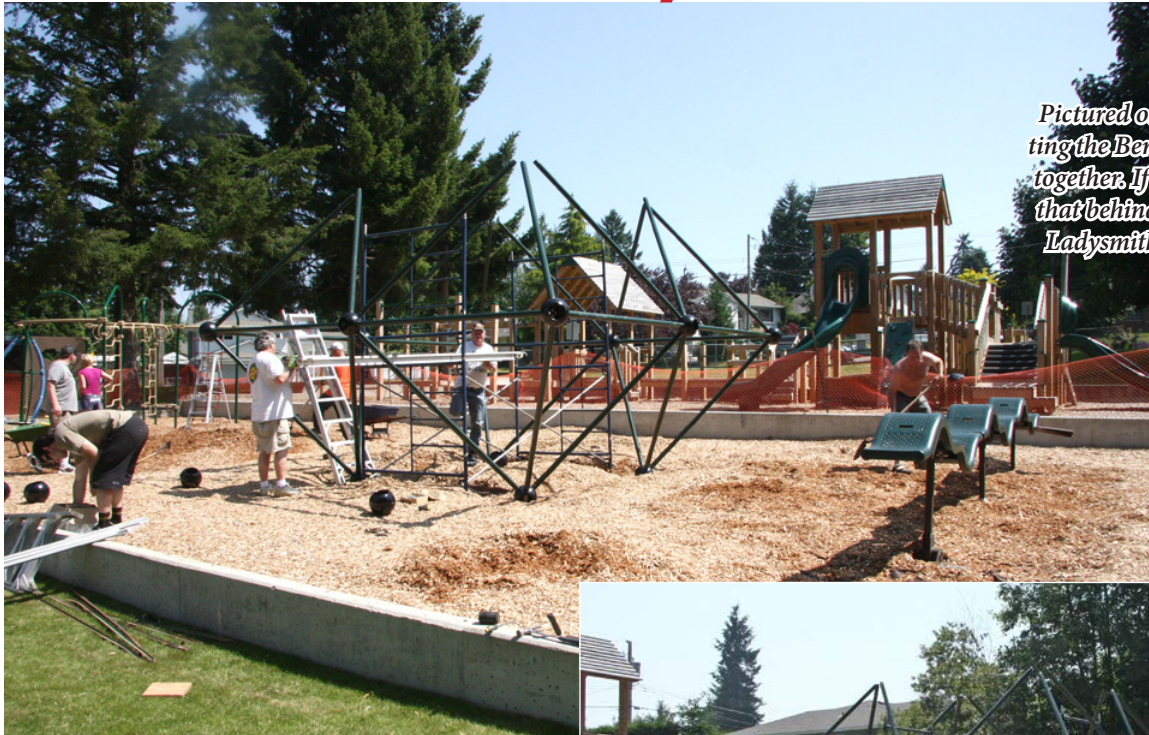
Pictured on the left are members putting the Berliner Neptune Climbing Net together. If you look just to the right of that behind the Xwave is the mayor of Ladysmith helping to level the Fibar ground cover.