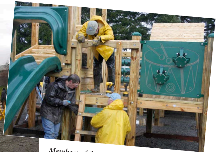
Members of the Ladysmith Festival of Lights help to put the finishing touches to a climbing ladder in phase one.

Wow!!!! Phase One!!! ... and we did it in two days! Shown here are some of the members of the Ladysmith Kinsmen Club on the completion of phase one of the new playground at Kin Park.