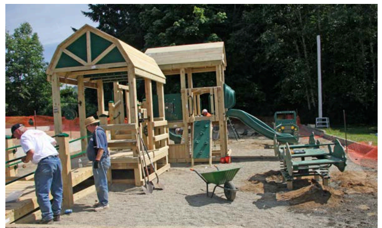
Phase two was designed for the younger “players” in the new playground. It has more “hands on” equipment that moves and bounces.