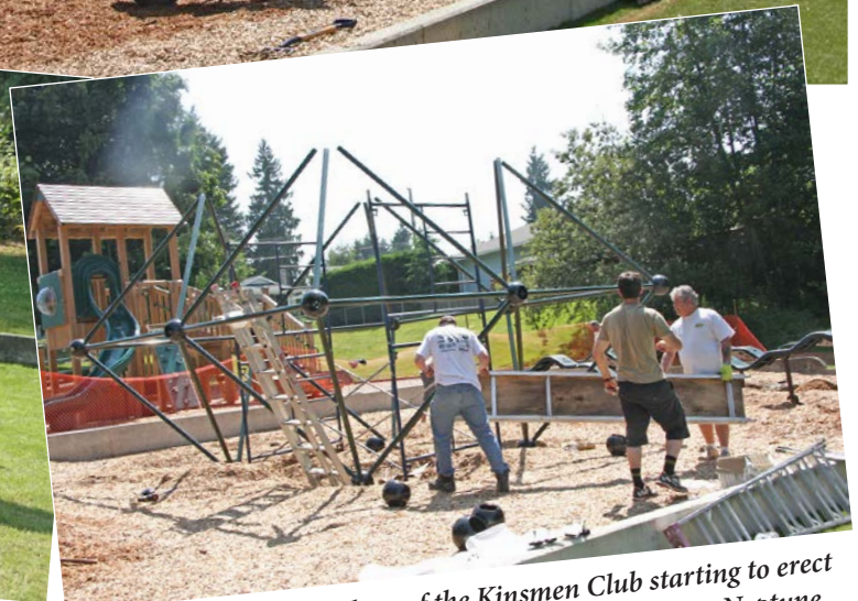
Pictured here are members of the Kinsmen Club starting to erect the scaffolding that will be used to finish the Berliner Neptune climbing net.