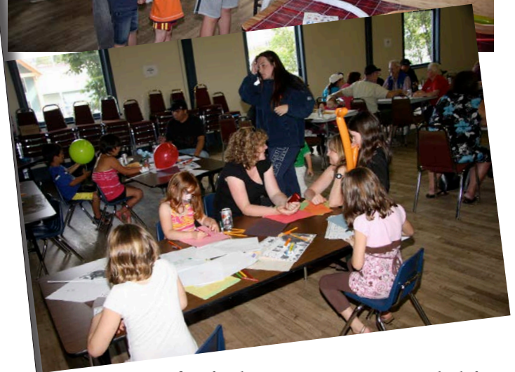
Our very first fundraiser was a success! On the left is the flyer that all the local merchants handed out for us. The top picture shows a volunteer making animal balloons and below that is a picture of the lady face painting and children colouring. The picture below shows families lined up to get their tickets for burgers.

Our first 'real' fundraiser was held on Sun., June 27, 2010. It really caught us off guard!!! We thought we would have about 100 people but when we opened the doors, at 4 pm, there was over 150 people waiting!!!! It was a huge success!!! The kids had a great time with balloons, face painting and as it turned out to be a beautiful day, many families had a picnic and enjoyed getting together. By the time we cleaned up we had served over 400 burgers!!!! We raised over $2,000.00!