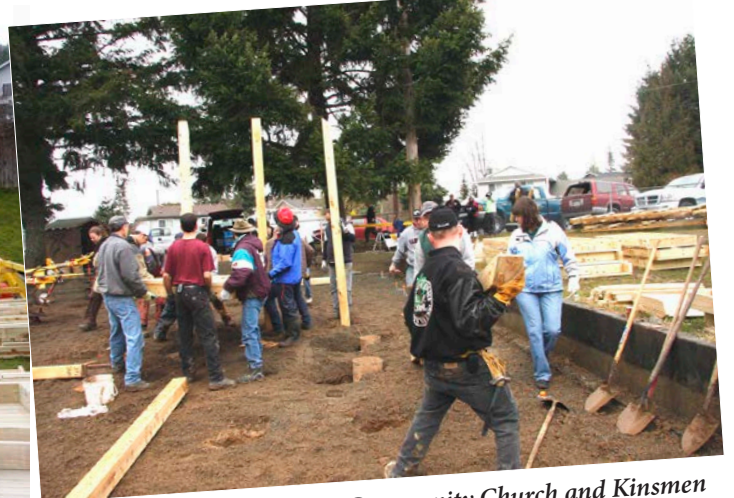
Members of the Oceanview Community Church and Kinsmen help erect the platform for the first structure in phase one.