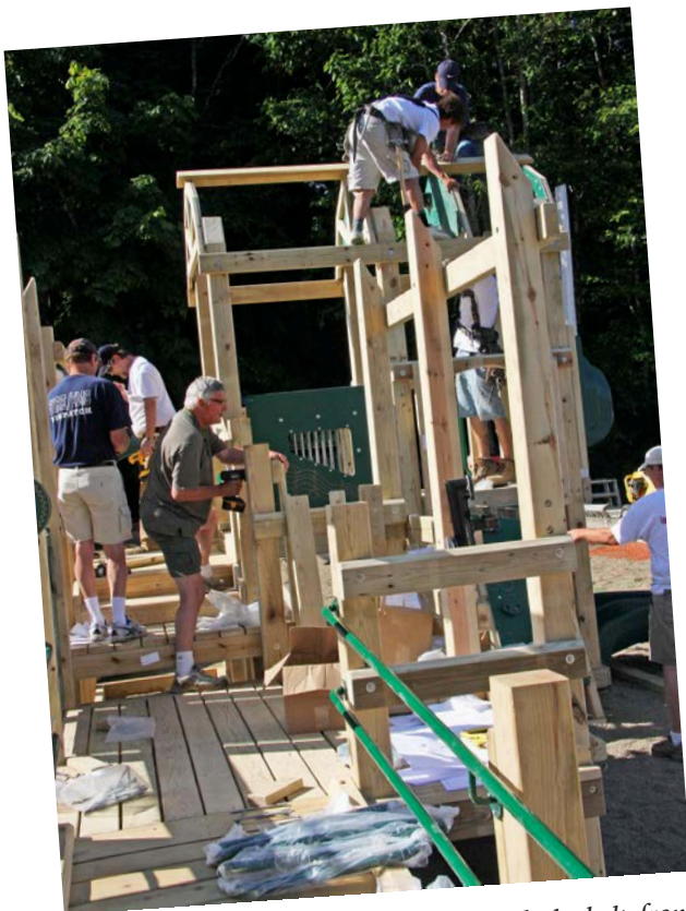
The Tot Structure really taking shape with the help from neighbours and members of Ladysmith Council!