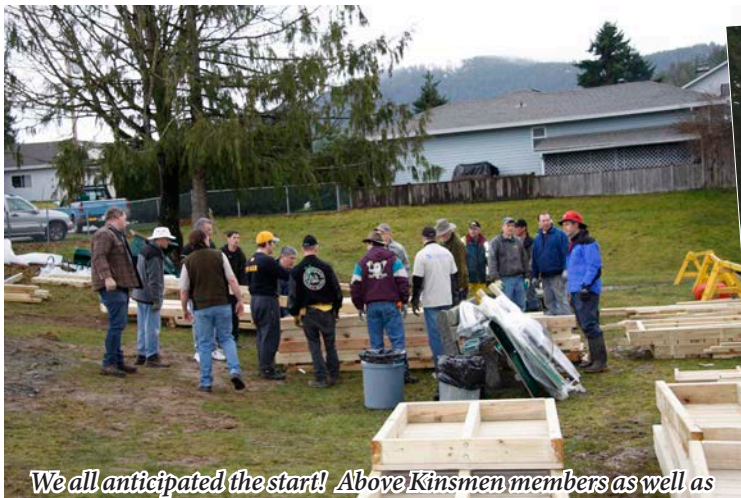
We all anticipated the start! Above Kinsmen members as well as community volunteers get ready to start construction of phase one during spring break 2011