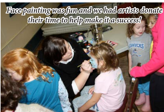
Face painting was fun and we had artists donate their time to help make it a success!