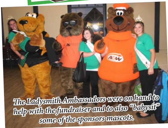
The Ladysmith Ambassadors were on hand to help with the fundraiser and to also "babysit" some of the sponsors mascots.

The Movie and Family Fun Time fundraiser was hugely successful! One of the things our club discovered in doing these types of events was... we might not have raised HUGE dollars but the fun that children and moms and dads had was great. It actually generated interest in the club just by us being there and putting on events that were family oriented.