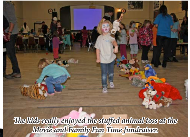
The kids really enjoyed the stuffed animal toss at the Movie and Family Fun Time fundraiser.